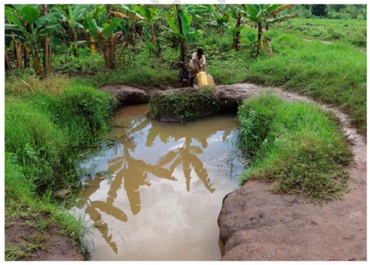
Fig.1 Source of water for the community

The main source of water used in one of the local communities in Uganda is a nearby stream as shown in the figure 1 .