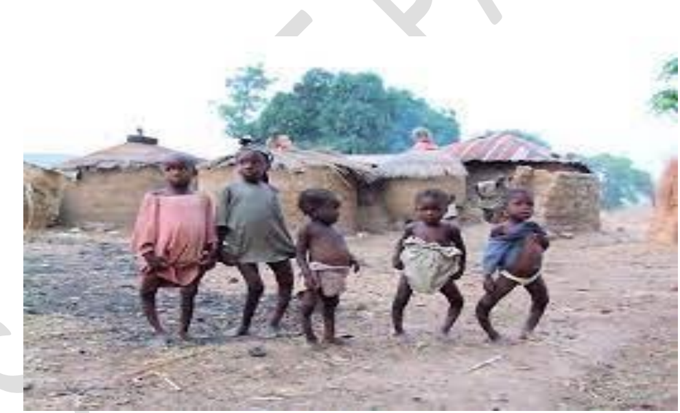
Fig. 3 Children with curved legs

During a home-based vaccination campaign, a vaccinator observed that in one of the homes the children she had vaccinated had curved legs as shown in figure 3 . The state worries mothers in the community but they do not know what to do about it. In her interaction with the vaccinator, one of the mothers revealed that their diet is composed of polished posho, boiled cassava and green vegetables.